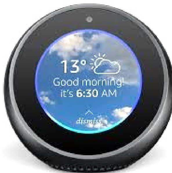
Figure 1. Amazon Echo Spot.

(Figure 1; Multimedia Appendix 1). At Amazon's suggestion, the Amazon Kindle Fire (Multimedia Appendix 1) was trialed in some homes. Early feedback indicated that Echo Spot devices were more physically robust, and Kindle Fires looked more like "regular tablets," which some homes owned and had limited use for. With this feedback, Echo Spots were distributed until October 2019, when they were discontinued. Subsequently, we offered homes the Echo Show 5 (Multimedia Appendix 1).