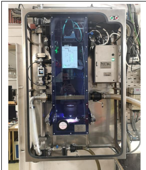
The Plankton Imager, recently developed by Cefas and Plankton Analytics in the UK, is an imaging tool for sampling zooplankton without the need of human intervention. It consists of a high-speed camera that images all passing particles in a flow of pumped seawater. Images are identified in real-time and uploaded via satellite. This system requires no on-board expertise, harmful chemicals, or deployment of gear from the ship. It can collect data at a significantly finer spatial resolution than traditional methods. It also measures zooplankton, supporting carbon accounting. In its current state of development, its main capability is counting copepods.

The high-quality and consistency of data collected in this manner facilitates comparisons over long time periods and between laboratories. The North-East Atlantic Marine Biological Analytical Quality Control (NMBAQC) Scheme provides a source of external Quality Assurance (QA) for laboratories engaged in the production of such marine biological data. Through the NMBAQC, laboratories engage in annual intercomparisons to ensure the phytoplankton and zooplankton data they generate are comparable to other laboratories and over time.