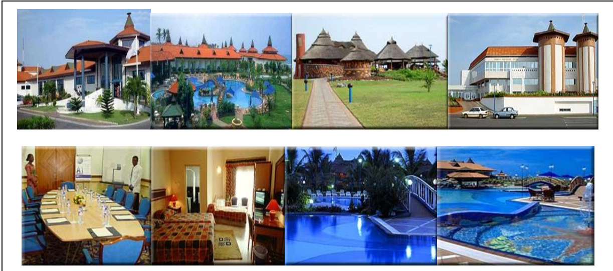
Figure 5. La Palm Royal Beach Hotel, Accra