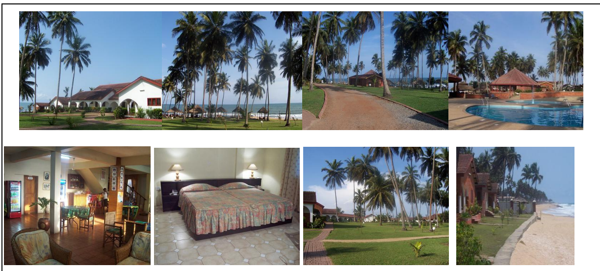
Figure 4. Coconut Grove Beach Resort, Elmina/Cape Coast