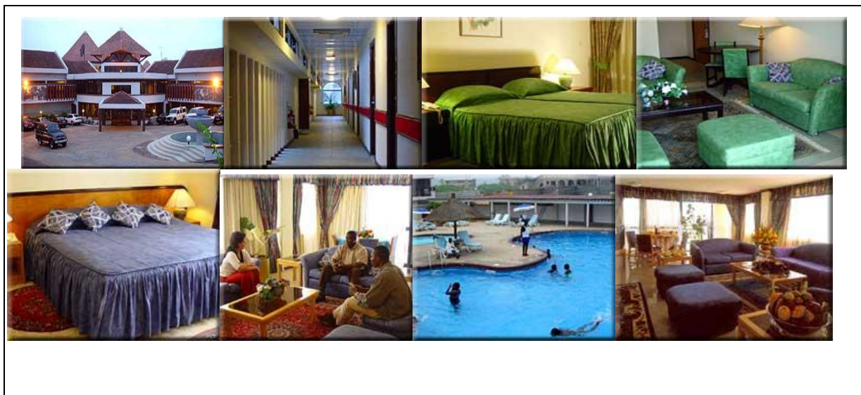
Figure 6. Elmina Beach Resort, Elmina