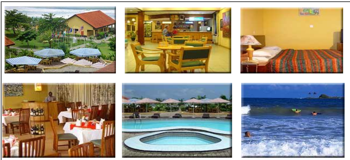
Figure 7. Busua Beach Resort near Sekondi-Takoradi