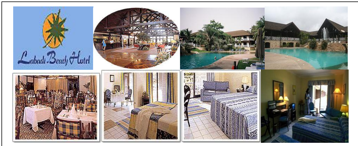
Figure 3. Labadi Beach Hotel, Accra