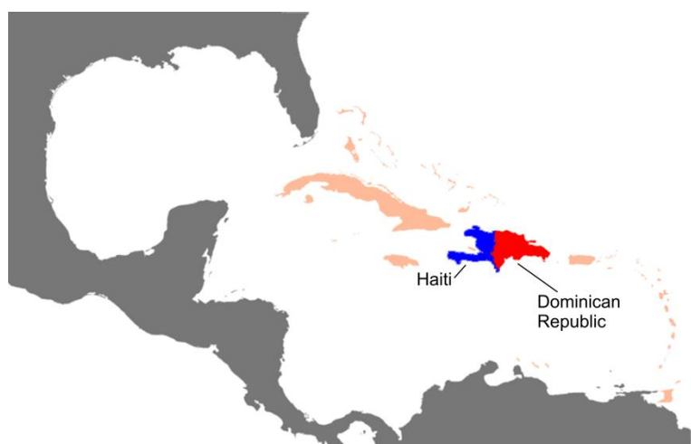
Figure 1: Haiti and the Dominican Republic