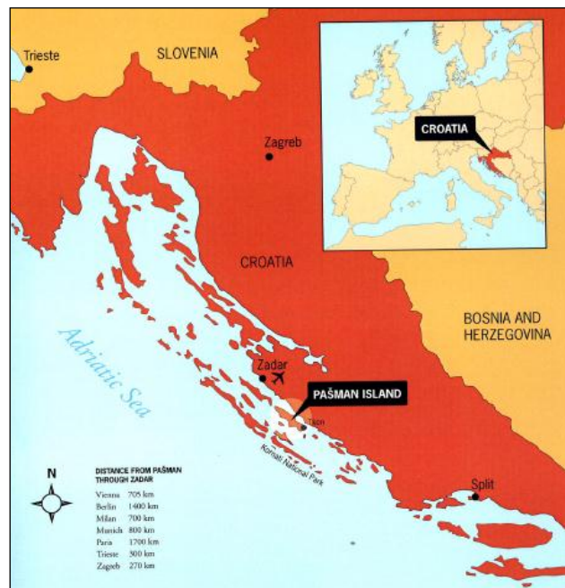
Figure 3. Map of destination site: Pašman Island, Croatia