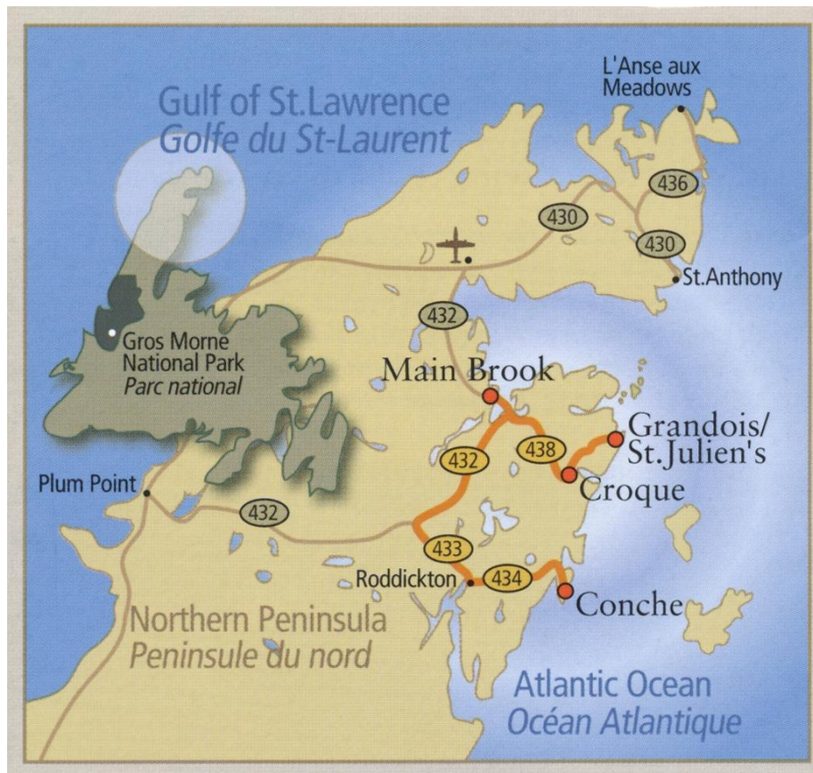
Figure 2. Map of destination site: Northern Peninsula of Newfoundland, Canada