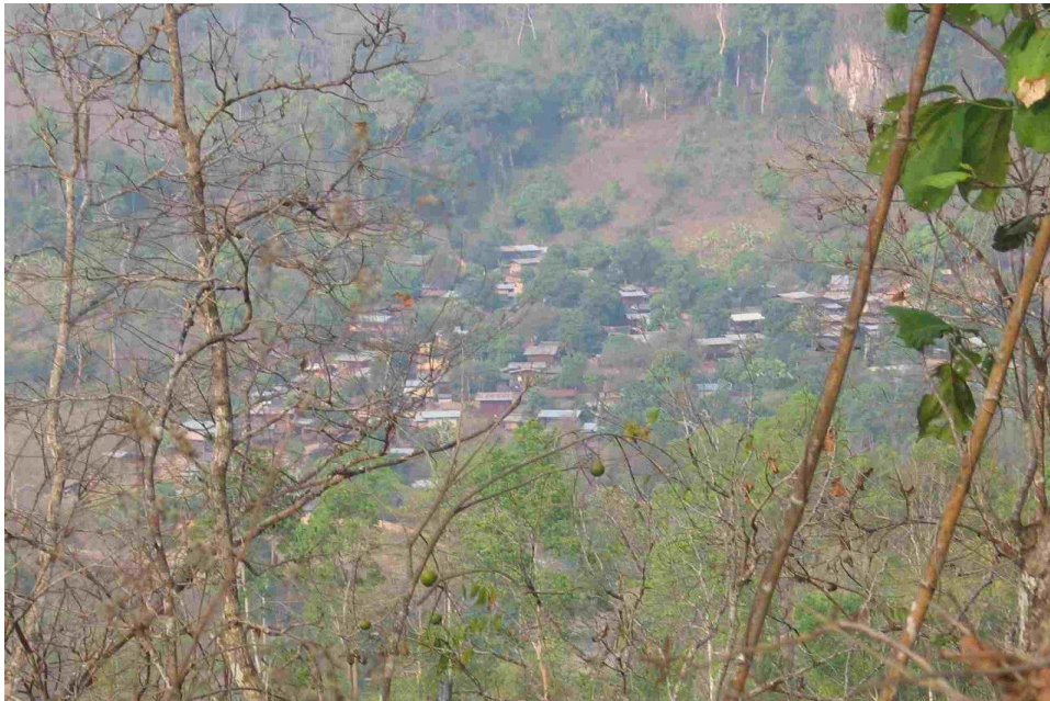
Plate 2: Muang Pham Village

following sections I start with a discussion of tourist- and host-gaze concepts before outlining the regional context of ethnic minority tourism in Thailand.