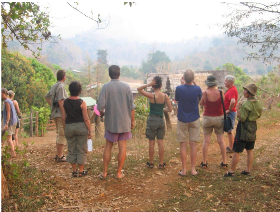
Plate 9: Muang Pham village sightseeing

attractions are on the one hand the natural landscape and nearby cultural sites, and on the other hand tourist activities such as elephant riding and bamboo rafting. The Karen women play a central role in the tourism of Muang Pham and can be observed weaving products which are also sold to tourists. Included in the price of the trekking tour is an overnight stay in the village and meals, which are carried in and cooked by the guide. Since experience has shown that the Karen cuisine does not agree with the tourists, the Muang Pham villagers provide only rice, soft drinks, and beer. Muang Pham has a wide variety of tourist activities that go beyond the few square meters of Jorpakha's offerings. Nonetheless a definite segregation of tourists and native Karen can be observed. The main tourist activities such as elephant riding, bamboo rafting, and visiting the caves take place outside of the village. The guided tour of the village generally lasts from 30 to 60 minutes. In the homestay, the tourists are lodged in an area separate from the occupants or operators.