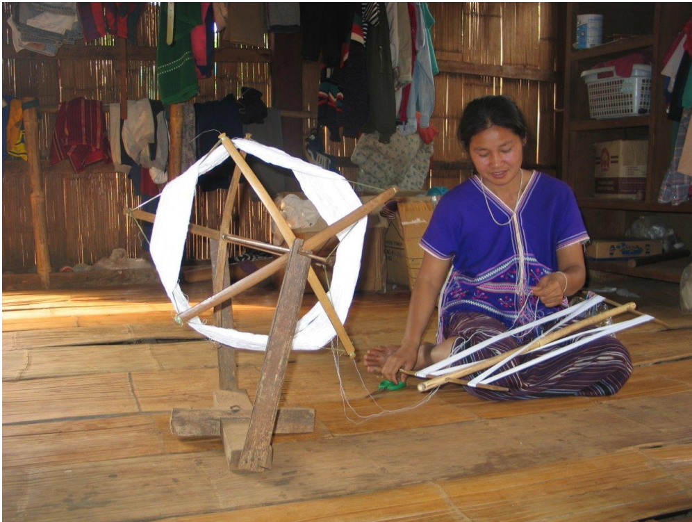
Plate 11: Weaving for tourists in Muang Pham

television voices to echo through the homes. These obvious observations cause experienced tourists to identify the village as unauthentic or even spoiled. Villagers are aware of the tourist's quest for cultural exoticism and in some cases they make use of this when wearing the traditional clothing and impressive jewellery in order to fulfil the desired authenticity and to make a better sell.