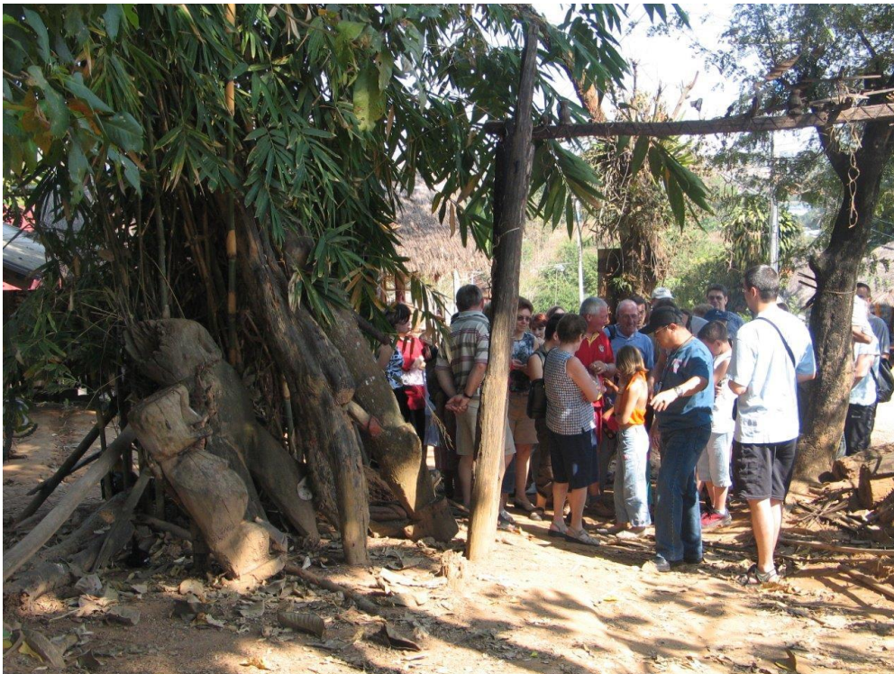
Plate 3: Tour group at the entrance gate

are handmade, but for the most part ordered from companies in Chiang Rai, Chiang Mai, or in Tachilek (Burma/Myanmar). The main attraction are the exotic Akha themselves, in particular the women, who wear imposing head decorations. Akha-specific “cultural goods” and tourist attractions such as the village gates and guard statues at the entrance of the village or the nearby swing, (only used during the Swing Ceremony) can be seen as objectified cultural capital (Bourdieu 1986).