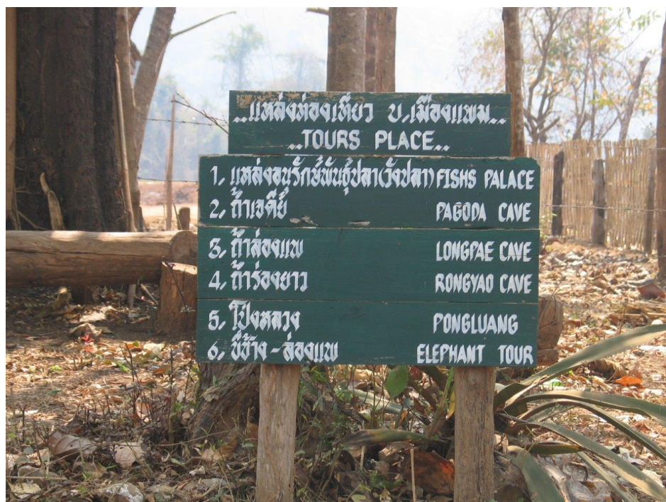
Plate 8: Muang Pham tourist information sign

Tourists arriving from Tamlod or Soppong are greeted at the village entrance by a welcome board and an information sign about tourist attractions. The village