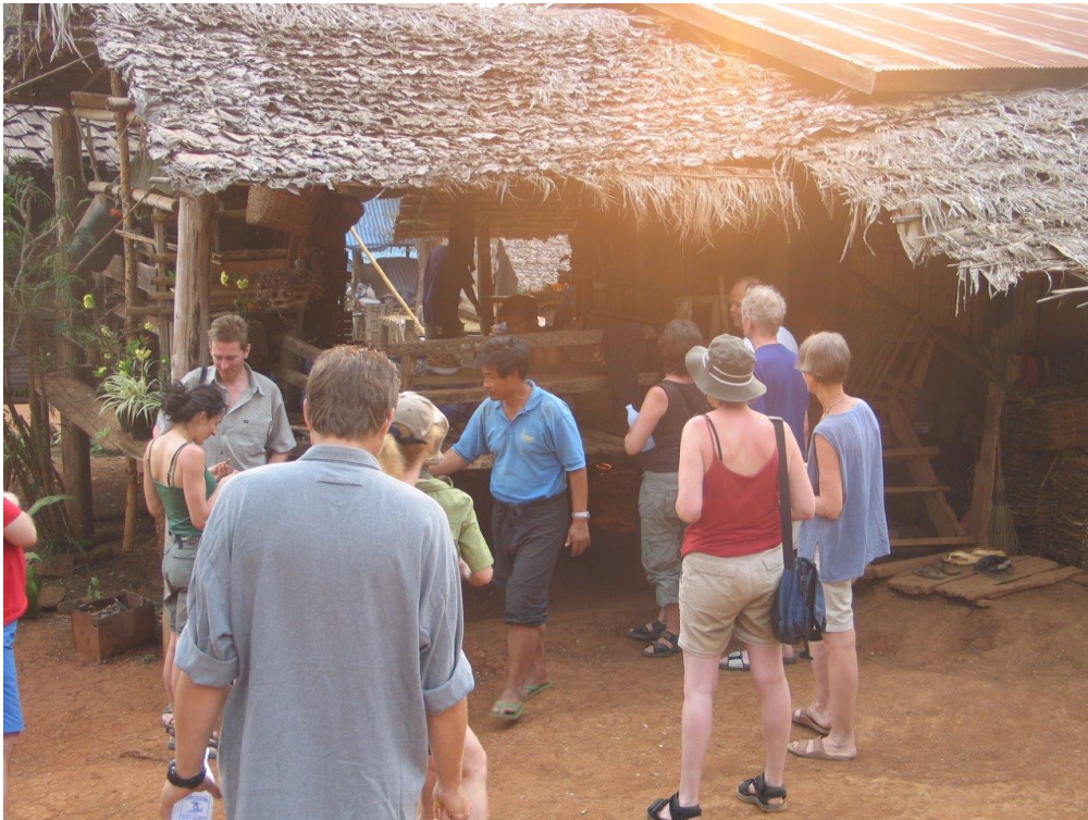
Plate 10: Muang Pham village sightseeing with trekking guide