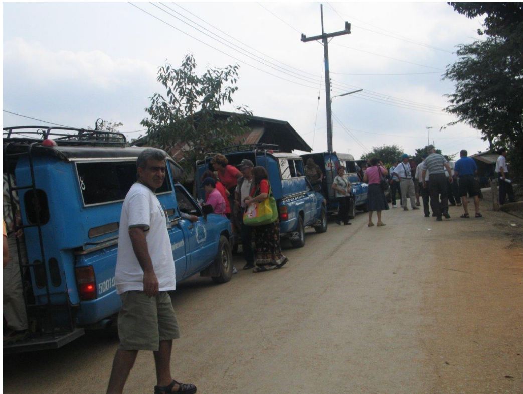
Plate 1: Arrival of tour group at Jorpakha village

tours or trekking tourism respectively (Cohen, 2001b, 69ff): First, the Akha village Jorpakha which receives approximately 100 tourists per day visiting this village for about 20 minutes as part of a package tour, thus showing characteristics of mass tourism.