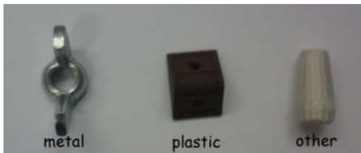
Figure 7: Triad 3 of objects, as viewed from the experimenters perspective, including description of the object that was metal, plastic and other material.