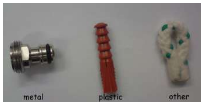
Figure 12: Triad 8 of objects, as viewed from the experimenters perspective, including description of the object that was metal, plastic and other material.