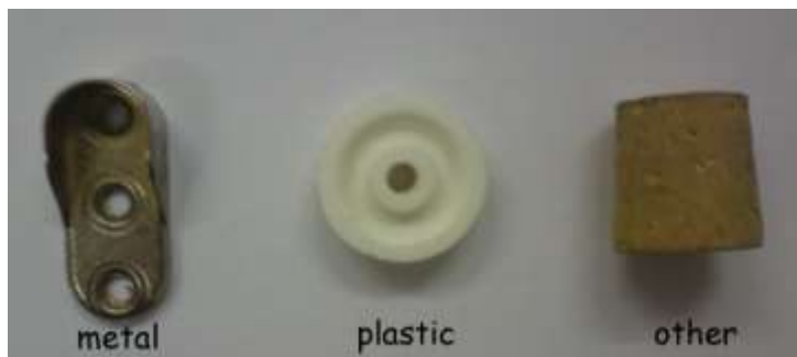
Figure 8: Triad 4 of objects, as viewed from the experimenters perspective, including description of the object that was metal, plastic and other material.