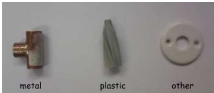
Figure 5: Triad 1 of objects, as viewed from the experimenters perspective, including description of the object that was metal, plastic and other material.