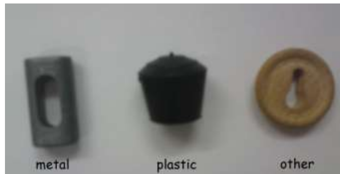
Figure 9: Triad 5 of objects, as viewed from the experimenters perspective, including description of the object that was metal, plastic and other material.