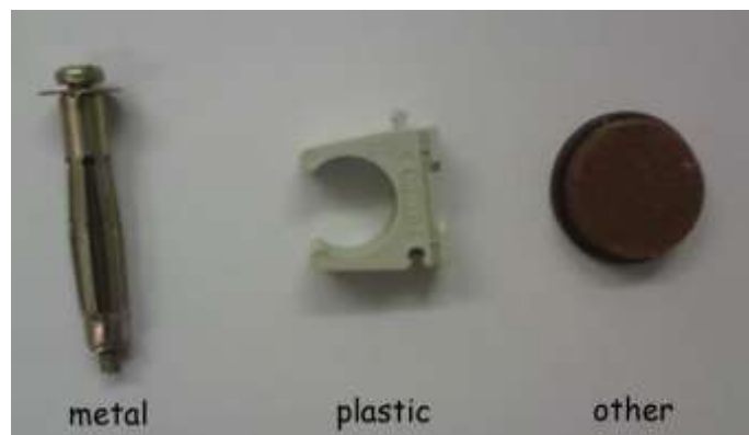
Figure 10: Triad 6 of objects, as viewed from the experimenters perspective, including description of the object that was metal, plastic and other material.