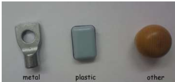
Figure 6: Triad 2 of objects, as viewed from the experimenters perspective, including description of the object that was metal, plastic and other material.