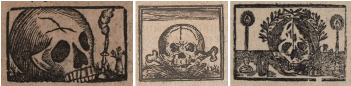
Figure 2: Skull Graphics (Details) from Viennese Execution Broadsides.

(C-39975/1754,3, p.4; C-39975/1744,1, p.1, C-39975/1939,2, p.4)