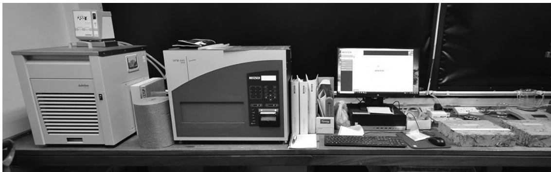
Fig. 2. Heat Flow Meter.

Further analysis using the Atterberg limits [4] found that the liquid limit of UK3 and FR3 is under 50%. This leads to the classifications of “ML”, low-plasticity silt. For soil UK4, the liquid limit was above 50%, giving a classification of “CH”, high-plasticity clay.