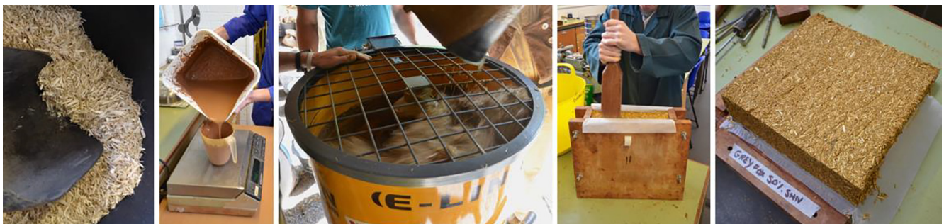
Fig. 1. Sample preparation stages. (left to right). Cut fibre, weighed slip, mechanical mixing, hand tamping, completed sample).

Due to their silt fraction, soils UK3 and FR3 are categorised under ISO 14688-2:2018 [29] as being "clSa", Clayey Sand and soil UK4 as "siSa", Silty Sand.