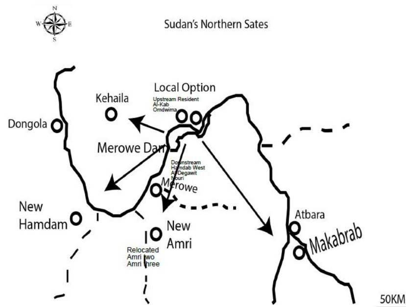
Figure 1. The study locations, downstream and upstream.

Unexpected shifts in government strategies in international investment for mega-projects and their social and environmental impacts, ignite regional and global debate (i.e., ideological, economic, and political). The Merowe Dam construction started in 2004 and became operational in 2009, becoming one of the largest dams in the Nile (Askouri 2007). It ignited economic and political struggles between downstream and upstream countries—Ethiopia and Egypt—especially in the context of the Grand Ethiopian Renaissance Dam construction.