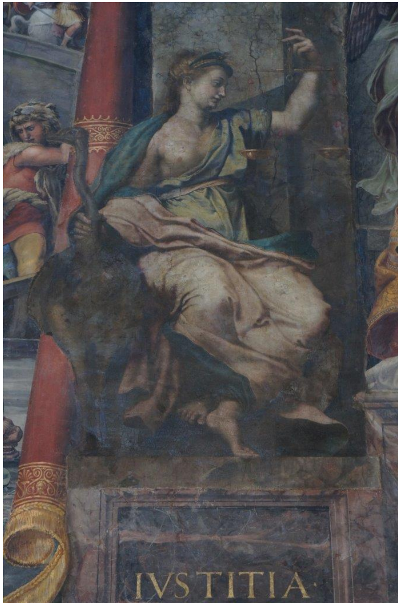
Figure 2 Battle of the Milvian Bridge . Oil mural and fresco. Raphael., da Udine, G., Romano, G., (1519-24)

The parallel here is with the ostrich's function in the Aesop fable 'The Ostrich and the Pelican' (Williams, 2013), mentioned in chapter one. With the Raphael painting, the ostrich offsets Lady Justice aesthetically, but contributes to the image by recalling the ostrich in Egyptian mythology. They gaze away from each other, but Lady Justice holds the ostrich's neck in one hand and the scales in the other, and in this sense is in control. In 'The Ostrich and the Pelican', an ostrich, which leaves its eggs to nature, chides a pelican for feeding her own with blood. The pelican responds that children are the highest calling. In this fable, the ostrich is a device that exists to affirm