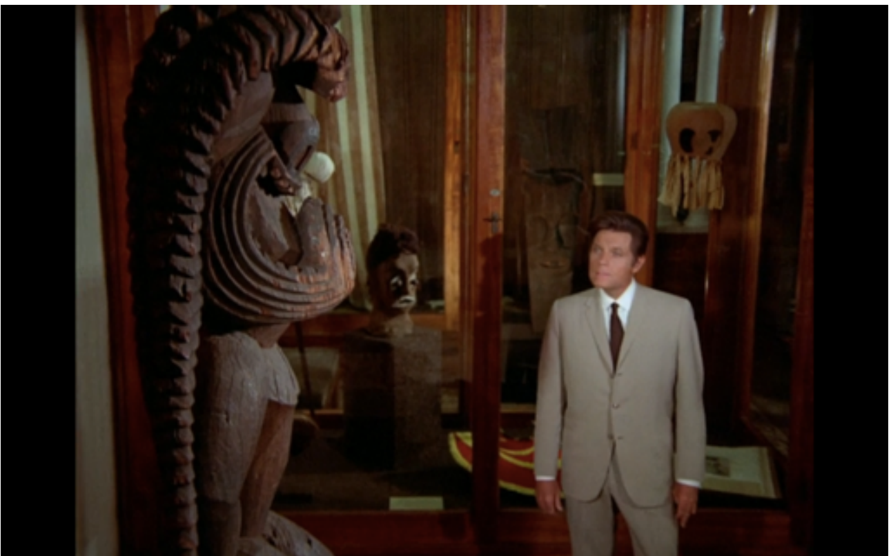
Image 2 - McGarrett considering the full body bust of Kū.