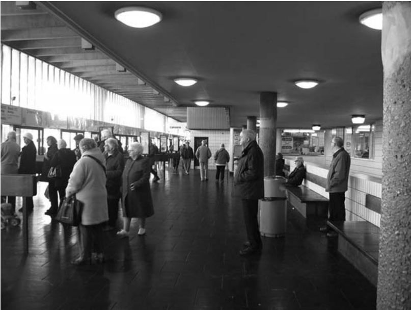
Fig. 1-1. Preston Bus Station.

In this example, we have a generic image of the inside of Preston bus station. The person is being asked about the redevelopment of Preston town centre and about their memories of its soon-to-be-replaced bus station. What this person does not do is remember the bus station itself. What he remembers is a personally significant array of events about his marriage—which he recounts in very loving and humble terms. The bus station is not a remembered image; it is used to spark a range of brightly impressed sensations and significances.