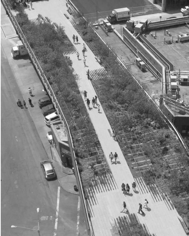
Fig. 5-4. High Line Park, view south from roof of Standard Hotel, photo by author, 2012

the 20 th century. Among the parks discussed in this essay, the High Line was the last proposed and the last designed. Covering just 6.7 acres, it is also the smallest—comparable in size to Central Park's Sheep Meadow.