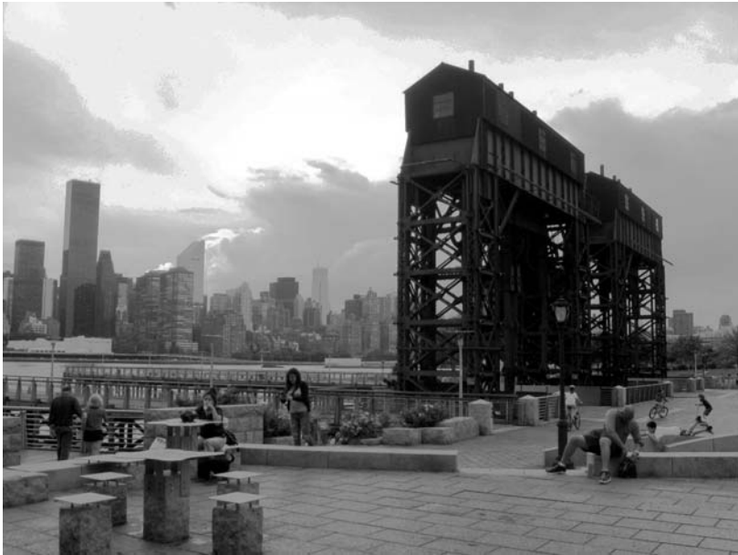
Fig. 5-2. Gantry Plaza Park, Queens, near 48 th St., photo by author, 2012

Hunters Point is the first stop in Queens on the No. 7 subway line. To better appreciate the area's past, walk north from the Vernon Boulevard station to 48 th Avenue. Here, the street is wider than most because it once accommodated below-grade train tracks that divided the neighborhood and connected the waterfront to the Pennsylvania (Sunnyside) Railroad Yards. Filled in 1994, this reclaimed area opened as Hunters Point Community Park in 1995. Approaching the East River, float bridges or gantries become visible (Fig. 5-2). Like the figurative bronze sculptures that punctuate the paths of 19 th century parks, these large steel structures speak directly of past successes and human deeds. Painted black, orange letters boldly spell out the words "LONG ISLAND," recalling the trains that once served passengers here, as well as the park's geographic location (Gray 2004: RE10; Dunlap 1994: 454).