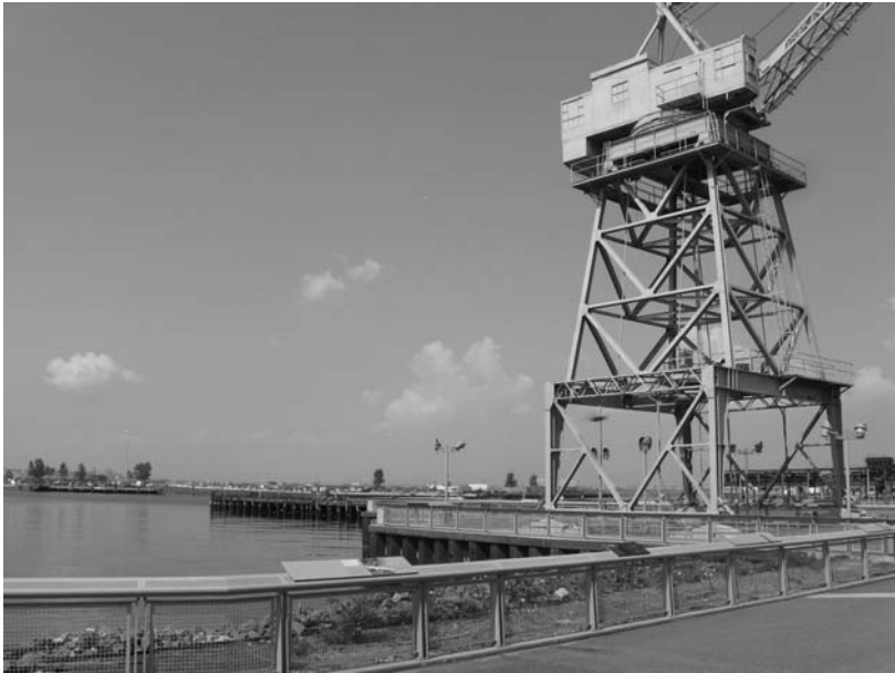
Fig. 5-3. Erie Basin Park, Brooklyn, west crane, 2012

Unfortunately, Erie Basin Park attracts relatively few visitors. While some observers might explain this by pointing out the absence of athletic fields, or that views into the park are blocked by the store's proximity and huge blue bulk, another reason may be that Weintraub's design is fairly utilitarian. Not only are many of the artifacts rusted and hard-edged but much of the inventively-designed seating appears to be uncomfortable. Lastly, one faces a somewhat active basin that, for some, lacks the glitz and glamour of a Manhattan skyline. Nevertheless, the park's spacious design is a handsome and satisfyingly practical one, balancing the retailer's need to limit maintenance with respect for the site's contribution to Red Hook's history.