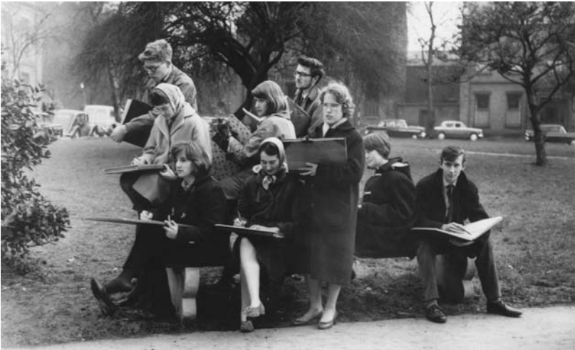
Fig. 1-2. Harris Art School.

I was a student at the Harris Art School in Avenham Lane, Preston from 1959 to 1961. We were sent out sketching in Preston, and we usually did a minimum of work. I remember when we were told to go to the docks to sketch, we hid underneath some empty goods wagons, peering out between the wheels, until we saw our tutor's legs go past. Then knowing that the coast was clear, we simply explored the docks for a while. He never did find us.