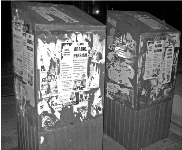
Fig. 4-2. Federal Mailboxes, Bloor Street

nature of the practice rendered it troublesome. 7 For unlike the sexually explicit billboard, also oriented to being seen and noticed, the poster could evoke danger, discomfort, and disruption since it presumably emerged from the taping, stapling, and wheat-pasting hands of people who inhabit the very streets on which it appears. 8