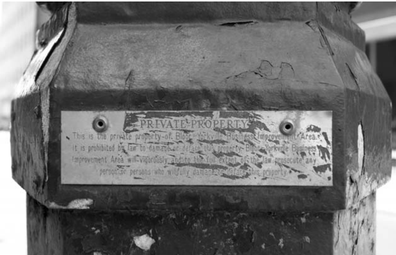
Figure 4-3. Plaque on Designer Light Pole, Yorkville

Coinciding with the postering issue, the Bloor-Yorkville BIA was initiating a multi-million dollar street transformation project; as noted by urban affairs columnist, Christopher Hume, this project could “only go so far without bylaw changes” (2003). “There are million dollar stores on Bloor Street, but not a million dollar streetscape” (de Lange 2003), complained the same spokesperson we heard from previously. While unsuccessful, revealing attempts were also made by the BIA to forbid hot-dog vending and panhandling from Yorkville streets. Mobile and nomadic, such activities legitimate uses of streets as embodied places in which to dwell, pause, eat, and possibly engage with strangers (Sennett 1994). In this way, they disrupt the image of the area as an enclave for “high-end” consumption and place of virtuously productive, i.e. capital generating, activity.