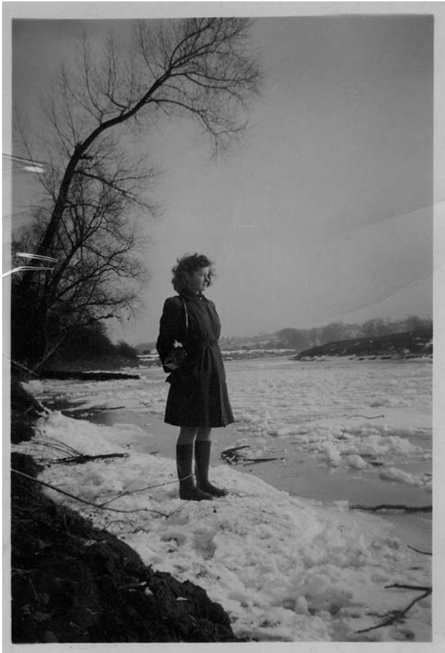
Fig. 1-3. Girl by the Lake.

It is not necessarily the story that is always grounded whilst the image is suspended. It is also the case that the snapshot image can work as a fixed and solid framework for a dream-like story in which things are apparent, then non-apparent and then apparent again. Sometimes it is the story that is dream-like rather than the image.