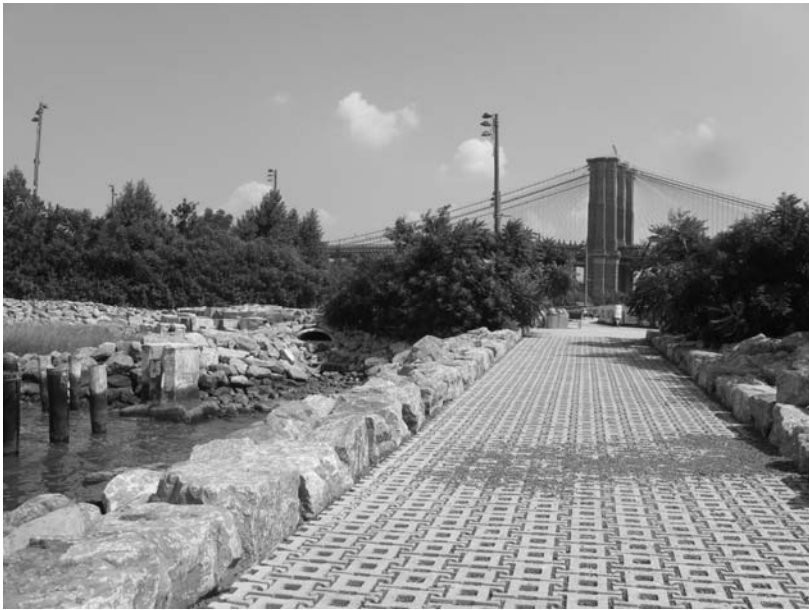
Fig. 5-1. Brooklyn Bridge Park, Pier 1, photo by author, 2012

space available in New York City, the Port Authority of New York & New Jersey looked across the Hudson River to New Jersey. The first, the Sea-Land Container Terminal at Port Newark, opened in 1958, shortly after container ships began to serve North America. This facility was surpassed in 1962 by nearby Port Elizabeth, devoted exclusively to handling container goods. The impact of these projects was swift, drawing freight away from the city's five boroughs. Though attempts were made in the mid-1950s to build complementary facilities along the East River in south Brooklyn, most had limited capacity and were far from transportation networks. Few, in fact, could compete with New Jersey and, by the 1970s, much of the city's waterfront sat abandoned and desolate (Kempner 1967: 205).