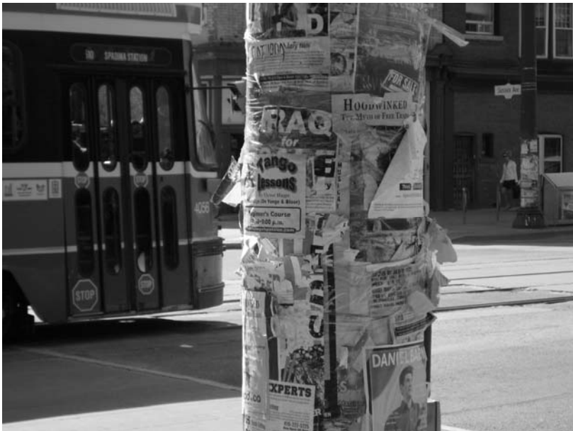
Fig. 4-1. Posters on Public Utility Pole, Spadina Avenue

since “anyone with a felt tipped pen and a roll of adhesive can do it.” 1 Indeed, the sights and sounds of taping, tearing, stapling, wheat-pasting, ripping and removing of posters, particularly in pedestrian concentrated, café, and shop-lined downtown neighborhood streets, constitute part of the visual and auditory texture of everyday/night life in the city. Unlike officially sanctioned forms of signage, dominated primarily by the forces of capital, the street poster appears as an exceptionally low-tech form of democratized mass communication. Neither posting nor removal requires the expenditure of money, censorship board approval, nor (typically) evasion from authority relations. And unlike the billboard towering inaccessibly above the passerby, posters’ editors are the nomadic urbanites who inhabit the very streets on which they appear; any poster may be touched, torn down, covered over, written upon, or rendered out-of-sight at any time. Rendering the city’s rich plurality of social life-worlds visible, the positioning of posters in relation to each other reveals this mixture as part of the very texture of everyday/night life in the city.