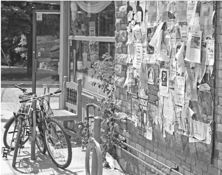
Figure 4-4. Community Poster Board, Linux Cafe

A particular reading of “messy democracy” came to crystallize, as street posters were translated as signs of local habitation that revealed neighborhood streets as unique places replete with history, identity, and vital social energies (Augé 1995: 52). At public meetings, during rallies, on the radio, on blogs, and in local newspaper articles, again and again, diverse Torontonians took to the stand in various ways paying tribute to posters, and describing the ways in which posters infuse the city with character. “It’s the lost cat ones that always get me”, noted one man, “They’re extremely personal. They mean so much more to me than a huge ad for some nightclub. This is how a community talks to itself.” (Blackett 2007). It was in this spirit that local public space activist, David Meslin, described posters as “signs that the city has a culture, (that) the city’s alive.” 21