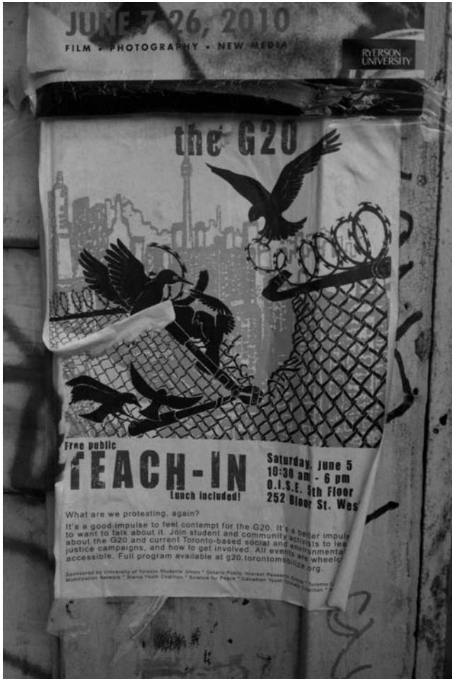
Figure 4-5. G20 Teach-In Poster, College Street

that it brought to public surface—had an impact on this outcome. True, many of the provisions from the original bylaw proposal were retained, including a controversial requirement that contact information be inscribed on the poster text. But by institutionalizing the category “community” poster, forms of expression that could be seen and said to emanate from within the collectivity (the city) were softly sanctified.