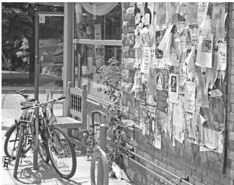
Figure 4-4. Community Poster Board, Linux Cafe

A particular reading of “messy democracy” came to crystallize, as street posters were translated as signs of local habitation that revealed neighborhood streets as unique places replete with history, identity, and vital social energies (Augé 1995: 52). At public meetings, during rallies, on the radio, on blogs, and in local newspaper articles, again and again, diverse Torontonians took to the stand in various ways paying tribute to posters, and describing the ways in which posters infuse the city with character. “It’s the lost cat ones that always get me”, noted one man, “They’re extremely personal. They mean so much more to me than a huge ad for some nightclub. This is how a community talks to itself.” (Blackett 2007). It was in this spirit that local public space activist, David Meslin, described posters as “signs that the city has a culture, (that) the city’s alive.” 21