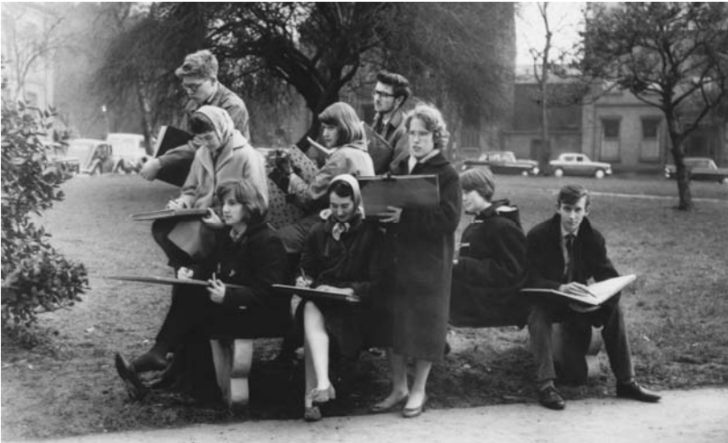
Fig. 1-2. Harris Art School.

I was a student at the Harris Art School in Avenham Lane, Preston from 1959 to 1961. We were sent out sketching in Preston, and we usually did a minimum of work. I remember when we were told to go to the docks to sketch, we hid underneath some empty goods wagons, peering out between the wheels, until we saw our tutor's legs go past. Then knowing that the coast was clear, we simply explored the docks for a while. He never did find us.