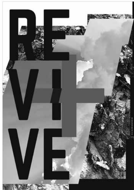
Revive + Message Covid-19 Special issue ©Kelly Salchow Macarthur Michigan, USA