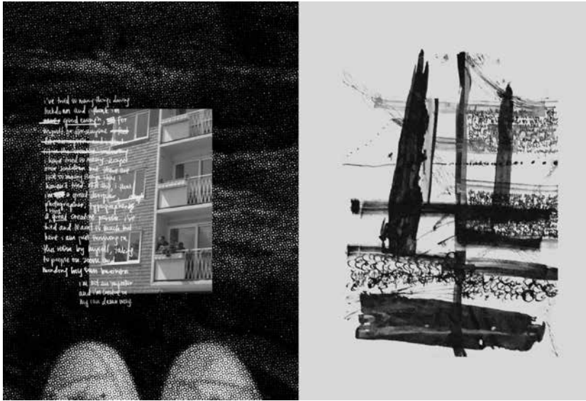
Self-reflection (2021) Message Covid-19 Special issue © Hedzlynn Kamaruzzaman Plymouth, UK

communicators' have contributed, for example, inspiring and capturing new ways of teaching and learning; reaching out and collaborating with communities; seeking solace in practice to provide comfort to themselves and others.