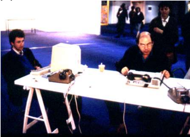
Figure 5: Networking in Toulouse, 1985. [5]

at the Slade School of Art, developing networking protocols on the UCL EUCLID mail server system, was played out in 1985.