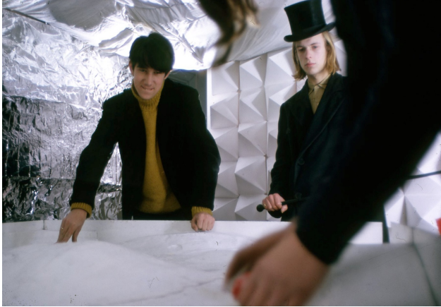
Figure 2 : Ground Course Behavioural Project 1963.

This strategy of dissolving the material artefact into a sequence of behaviours is now an invisible process underpinning all of our digital transactions - logging on,