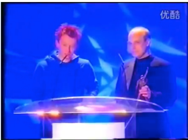
Figure 3: Brit Awards 1996. https://www.youtube.com/watch?v=QgVbkjNmVIU

The vertical nature of this pandemic was evident on stage at the Brit Awards in 1996. A not-so young Brian Eno presented Thom Yorke of Radio Head fame – with Yorke almost as young as Eno was in 1961. (Figure 3) [4]