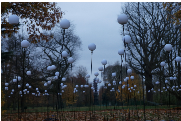
Figure 2: The devices and their cabling were required to be waterproof and durable, given the installation location and conditions and the 6-week installation period. The stands were manufactured from flexible plastic, and carried the DC 12V power supply that powers each device.

designing mappings [32] as well as methods for assessing their effectiveness [14].