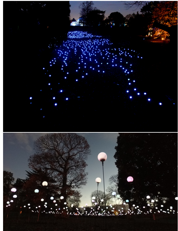
Figure 1: Bloom installed at Kew Gardens, London.

In this paper we report on the creation of a system made up of nearly 1000 distributed pixels all of which included audio capability and hardware, and which were connected together on a wireless