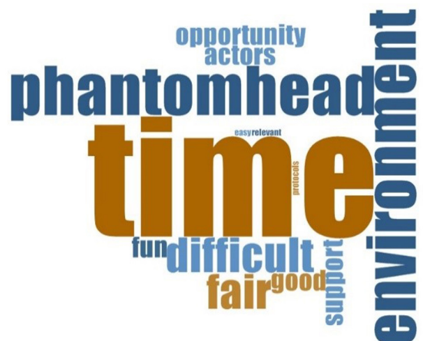
FIGURE 3 2018 word cloud.

The NVivo analysis produced a word cloud frequency for 2018 (Figure 3) which drew out the largest theme of time, this was once again in relation to critical appraisal. The introduction of a new environment, namely the introduction of a clinical skills station in a phantom head suite, created the next biggest themes.