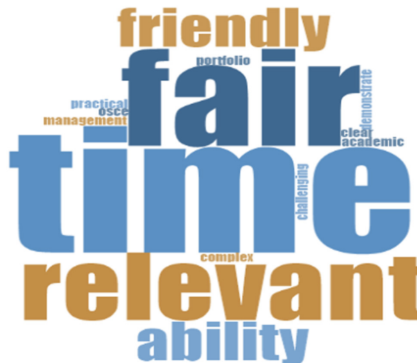
FIGURE 4 2019 word cloud.

The NVivo analysis produced a word cloud frequency for 2018 (Figure 3) which drew out the largest theme of time, this was once again in relation to critical appraisal. The introduction of a new environment, namely the introduction of a clinical skills station in a phantom head suite, created the next biggest themes.