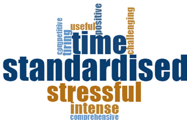
FIGURE 2 2017 word cloud.