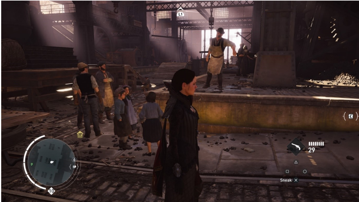
Screenshot from Assassin's Creed Syndicate (Ubisoft Quebec, 2015) which depicts child factory workers.

Syndicate does not present an idealised past (Greenberg, 2013), children are depicted working in factories and India might be the Jewel of the Empire but the subjugation of the country is still addressed directly. Reflective nostalgia is used to address the past whilst also providing a location and narrative to justify the gameplay featured in the game. Like the other videogames in the series (both before and after) there are gaps in the historical depiction, after all, it is telling an authentic, not an accurate tale, but by exploiting these gaps the voice of the game can stand out and provide a more even and engaging experience for the player (Donlan, 2018). They are aiming to create something that is authentic enough to pull the player into the experience and make them feel like they have a better understanding of London from 1868, whilst also engaging in a fictional narrative.