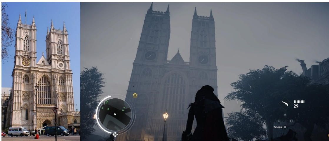
Left: Photograph of Westminster Abbey. Right: Screenshot of Westminster Abbey as recreated in Assassin's Creed Syndicate . 51

The above quote from Roy acknowledges the design decisions that transition the focus away from accurately recreating London and instead attempting to provide an ‘authentic impression’ (Sapieha, 2015). It would be far too time-consuming and costly to realistically create a digital version of Victorian London, but the developers can only stray so far whilst still claiming to provide a version of London. Therefore, the key landmarks are still present, but their position in the London area are not always accurate, distances between streets, and even the location of some of the boroughs is inaccurate, notably Whitechapel. Yet, this does not do enough to pull the average player out of the experience, especially not at first. It is also likely that for many players this will be their first instance of exploring a version of London freely, in turn, this will contribute to defining their perception of the city.