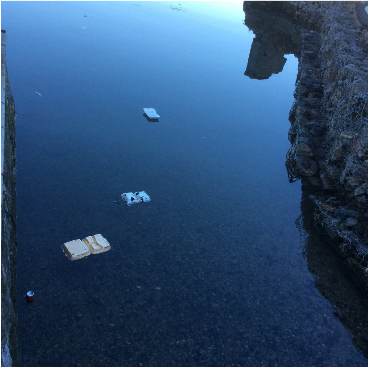
Figure 14: Detritus