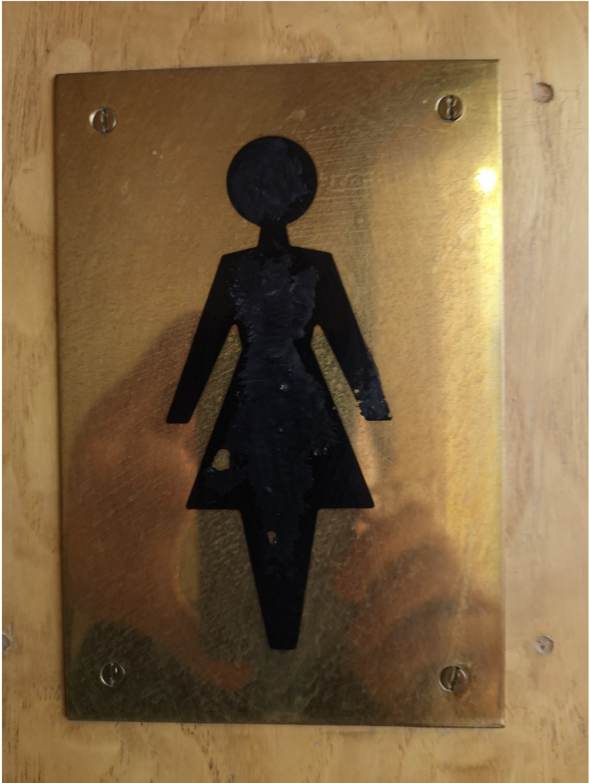
Figure 8: Ladies