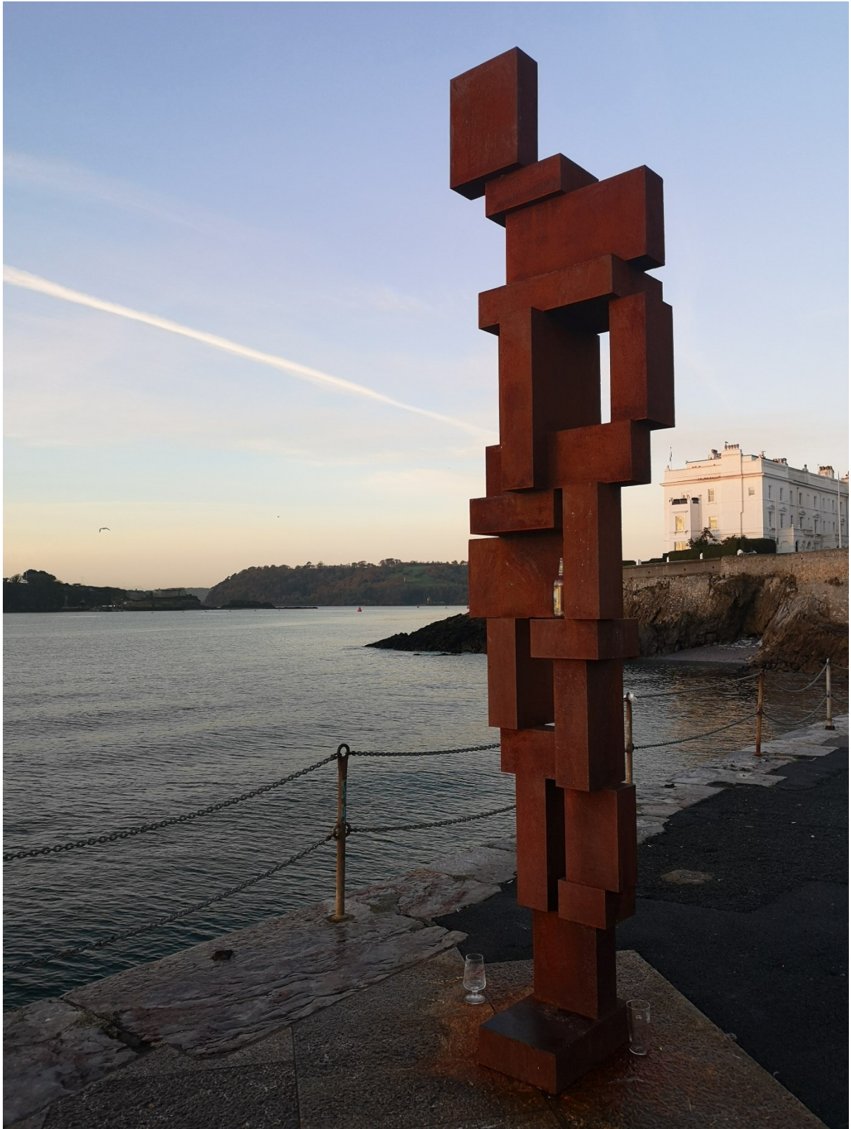
Figure 9: Lookout II, Antony Gormley.