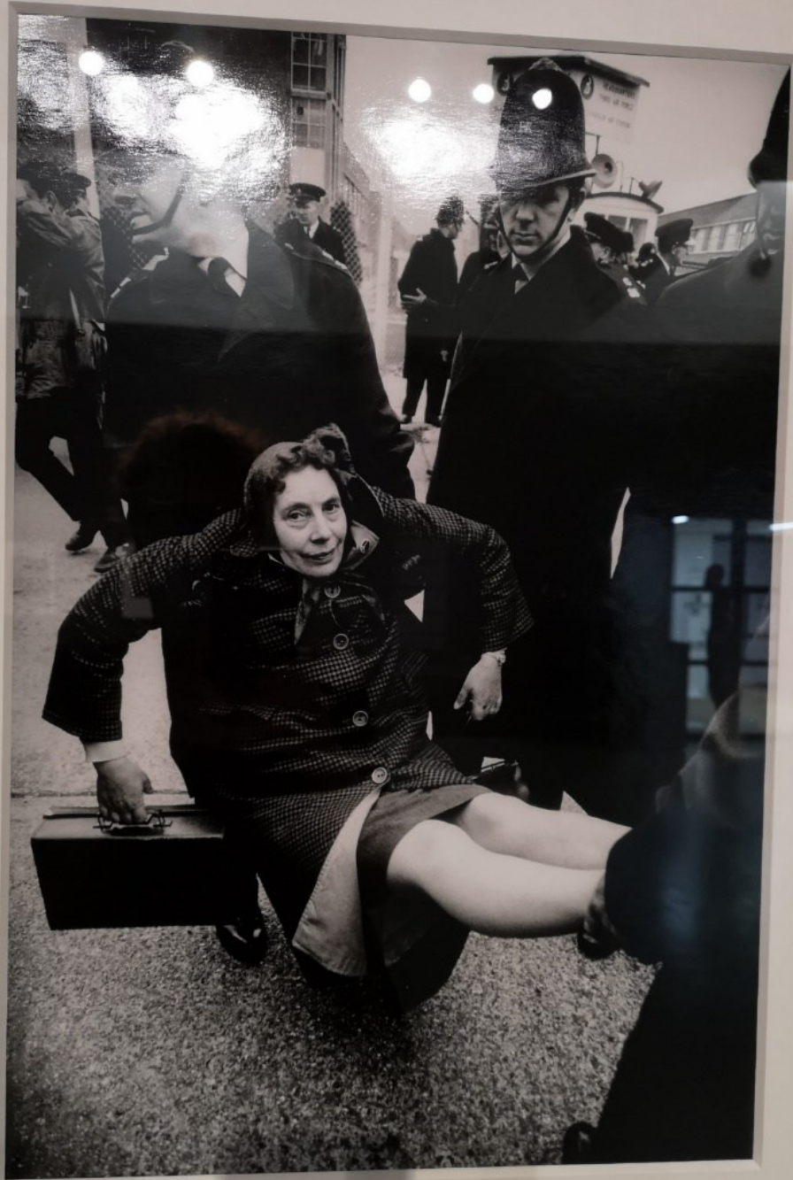
Figure 6. Ban the Bomb march, Aldermaston. Don McCullin.