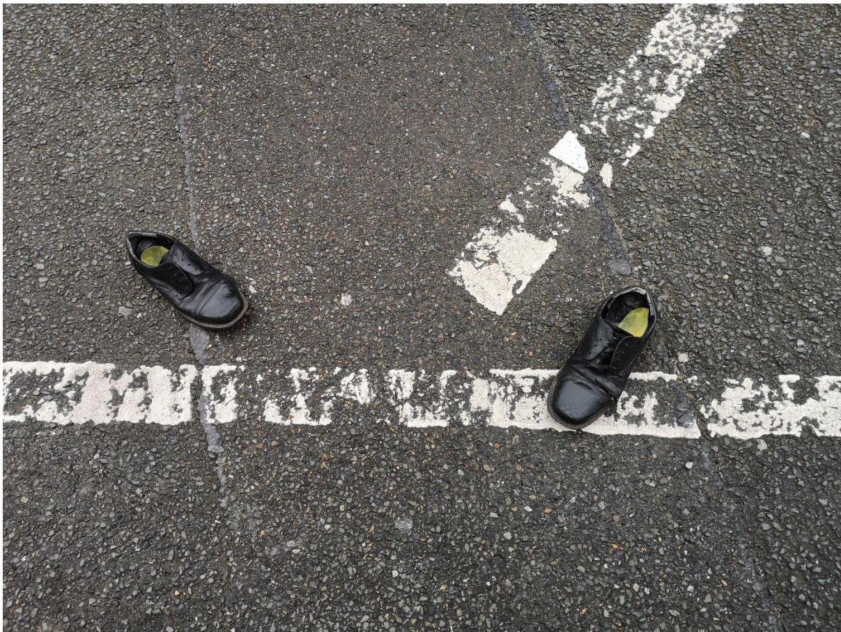
Figure 13: Two lost souls

The terrible scar on his side where his kidney was removed. His huge ribcage. Black curly hair. High forehead like my dad's. Peanut they used to call him. And worse. The nearest our tiny white village had to a person of colour. The eldest boy by default. Never able to take the place of the blue-eyed boy who had come first and been lost. Sickly as a baby. Uncoordinated. Bad at sport. Terrible teeth dragged into line by monstrous braces. Nose bleeds so bad there would be blood up the walls. Lonely. Bullied. Lying in the dark listening to Pink Floyd.