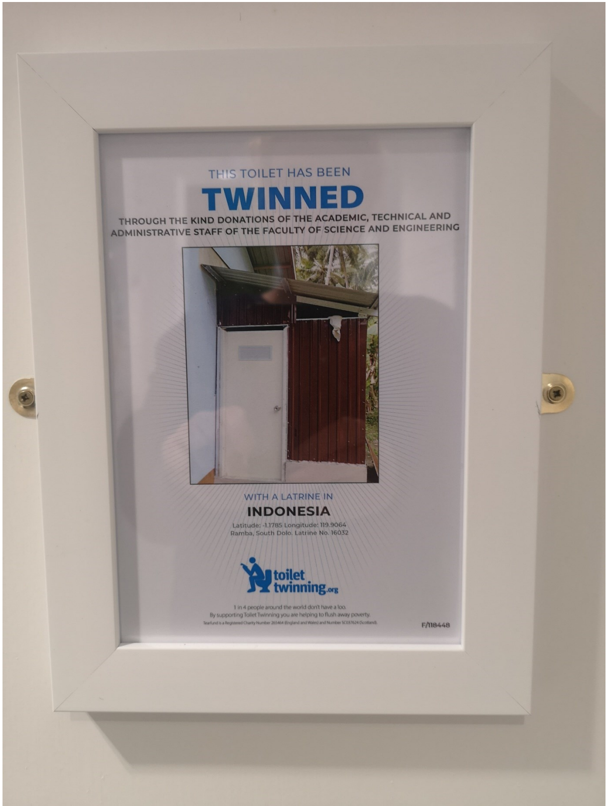
Figure 4: Latrine.