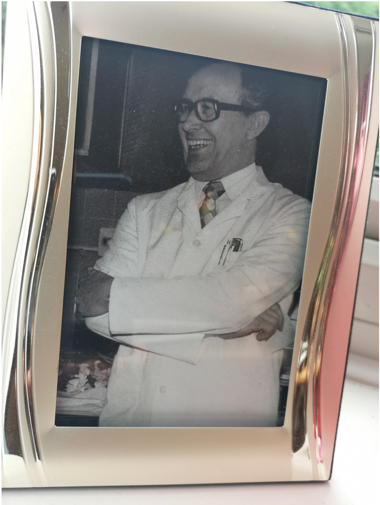
Figure 19: My dad