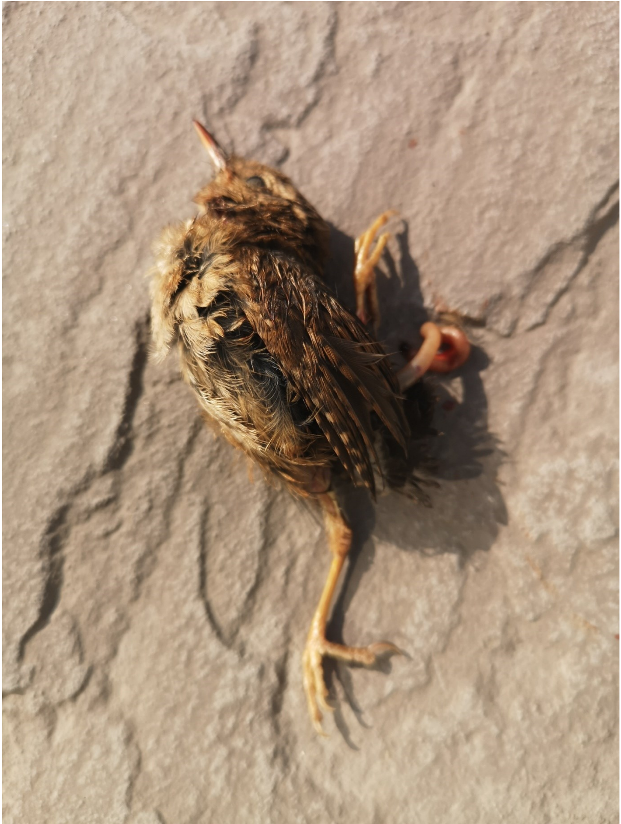
Figure 11: Dead Bird