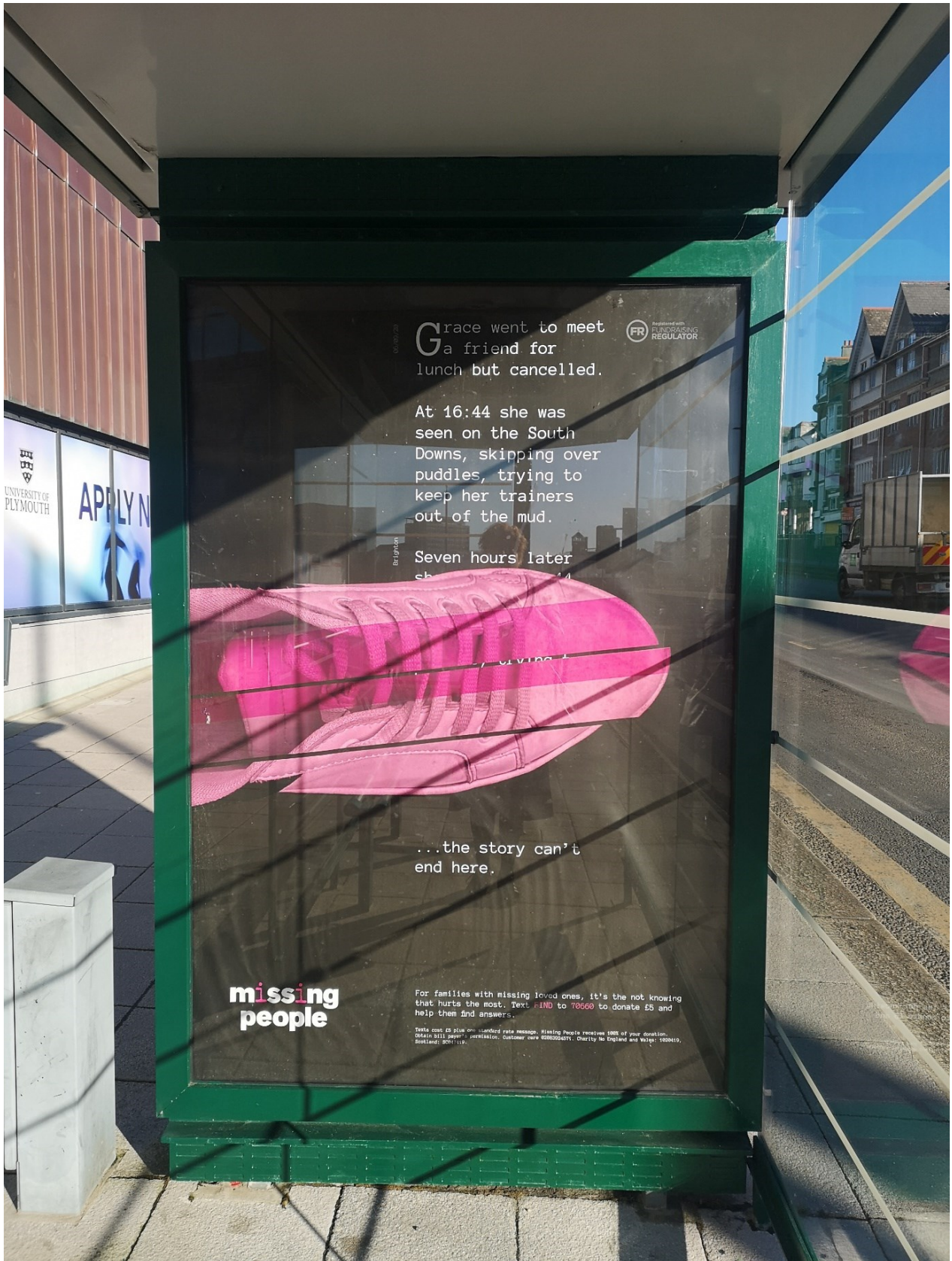
Figure 5. Pink trainers