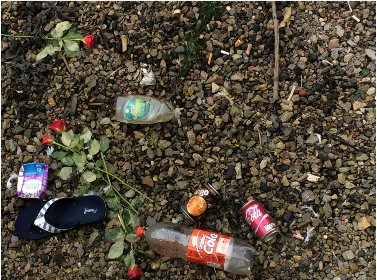
Figure 15: Matteringings