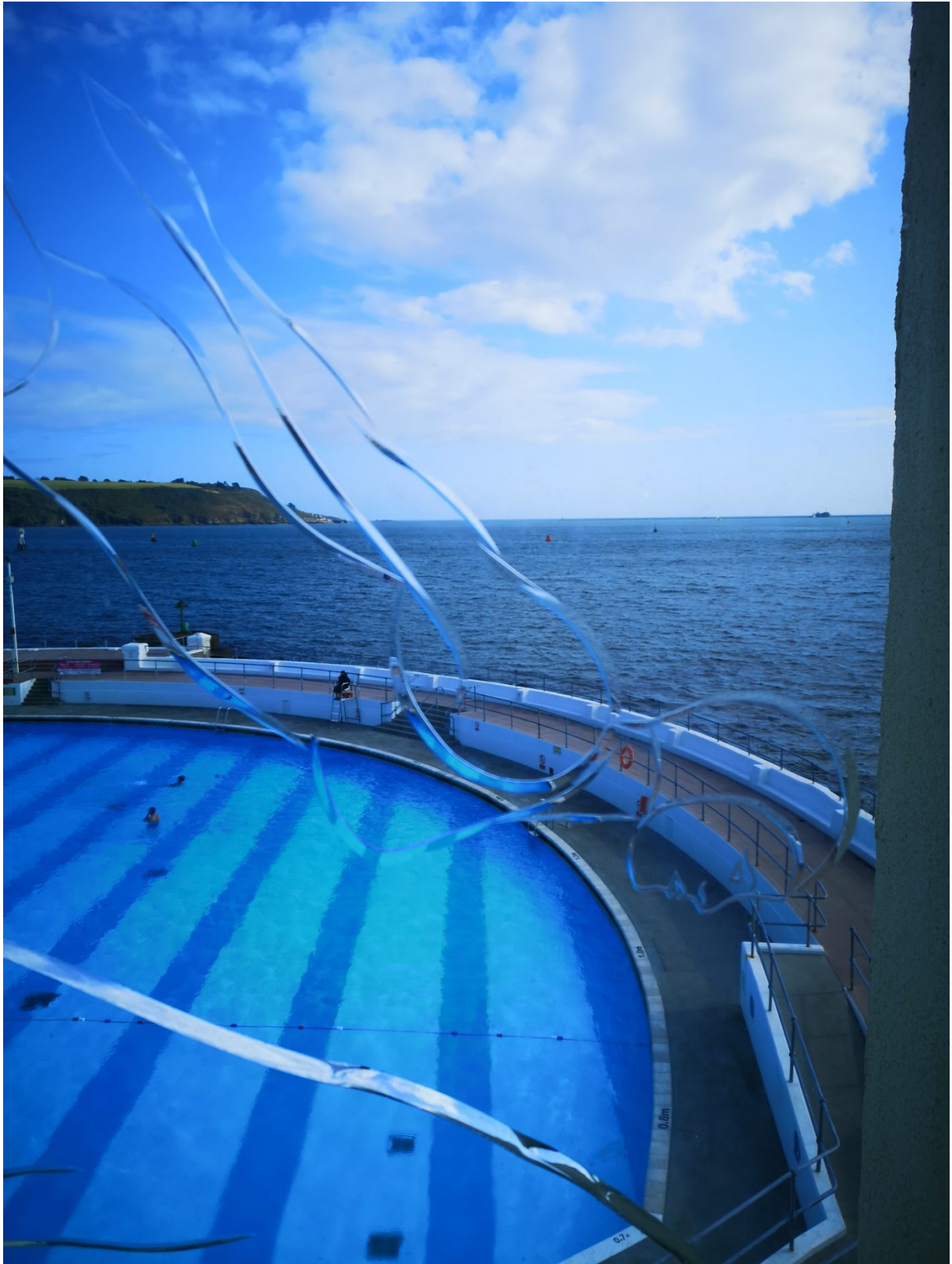
Figure 12. The lido