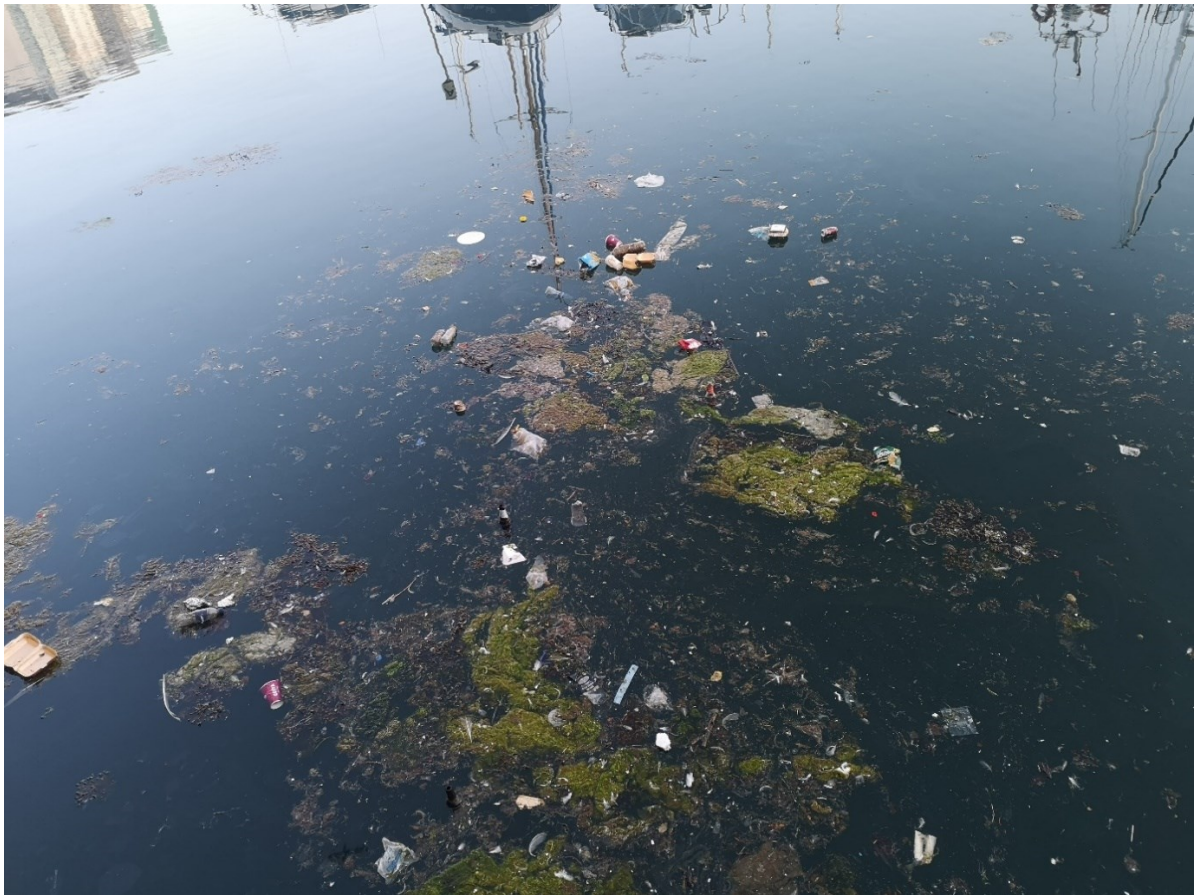
Figure 1: Disposable Bodies

This is a thesis that began with refuse and ends with refusal. Or the other way around.