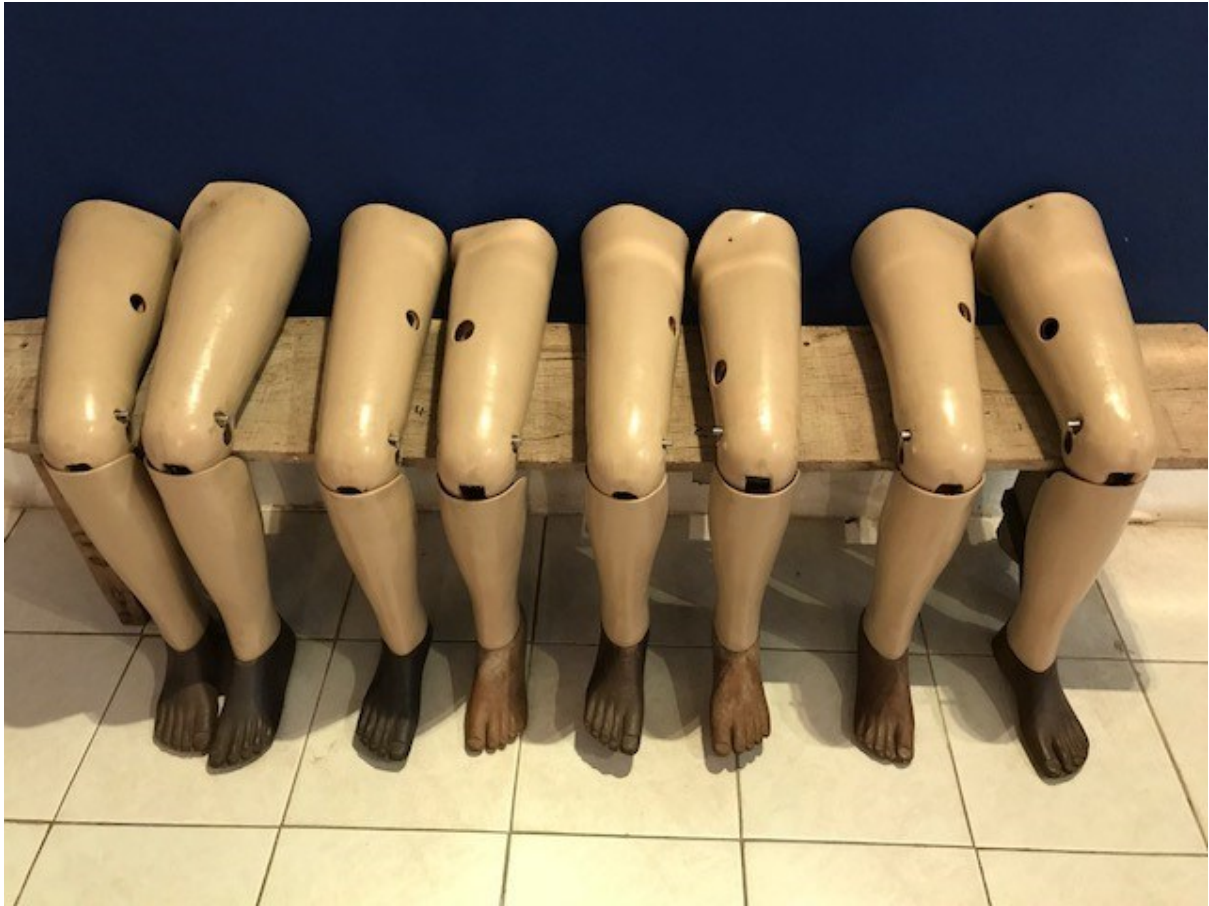
Figure 2: Legs

Another August. Another time. Five years ago. A year after my father died. I was so sad. So drained. So desperate. Still grieving. For my dad. Still furious at my body's betrayals.