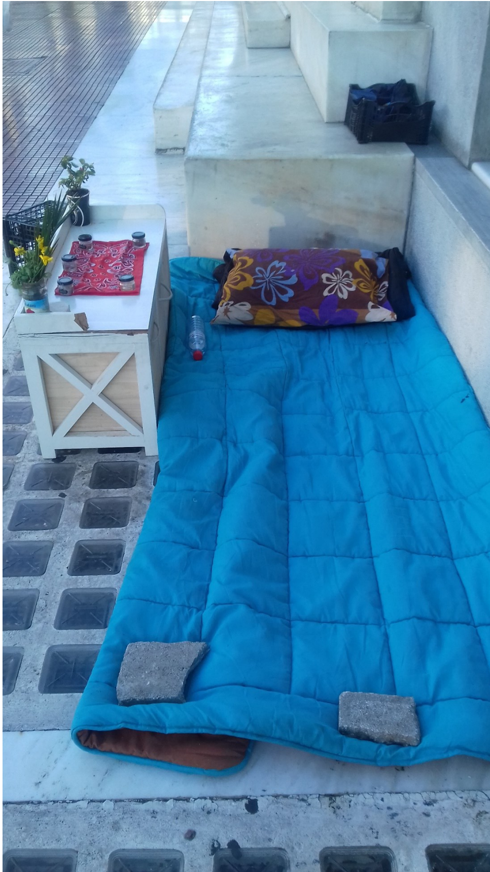
Figure 16: Athens