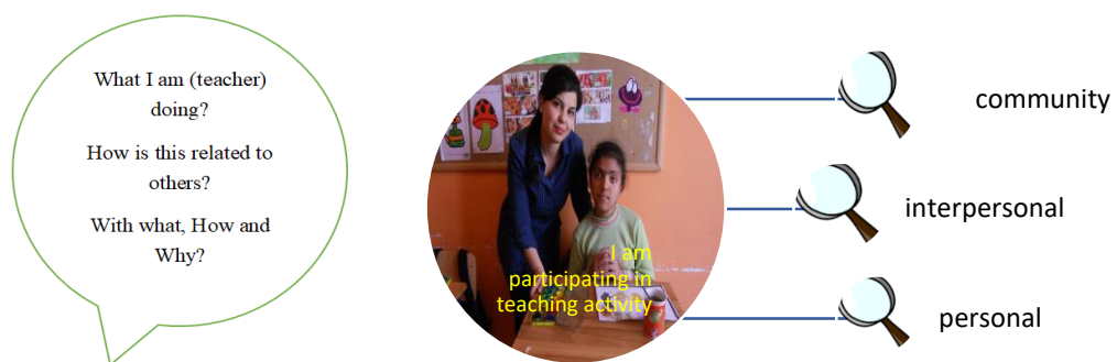
Figure 1. Looking through the lenses of Rogoff’s three planes of development, focusing on different processes in supporting a child with reading difficulties

Here I am teaching a child with reading difficulties (Figure 1); after carrying out my study, how do I now understand how my teaching strategies have been shaped across the different planes of development?